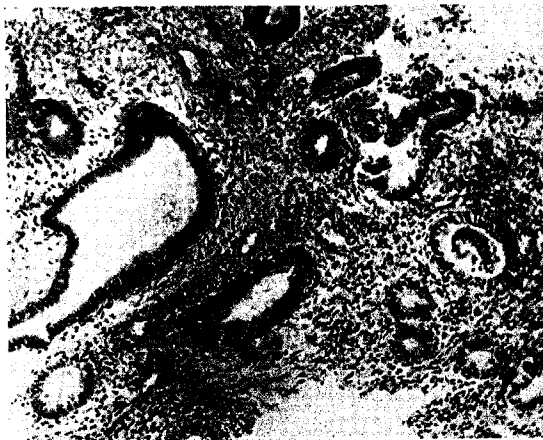
Fig. 1.—Endometrial biopsy before therapy; nonfunctioning endometrium cystic glands. Dense stroma.

Estrone 10,000 I.U. once or twice a week, and for 2 years had relief from flushes. Implant : May 6, 1940, 52 mg. of estrogen. Smears : March 18, typical castration cells; June 23, excellent estrogenic function; September 5, good estrogenic function; October 1, return of castration cells.